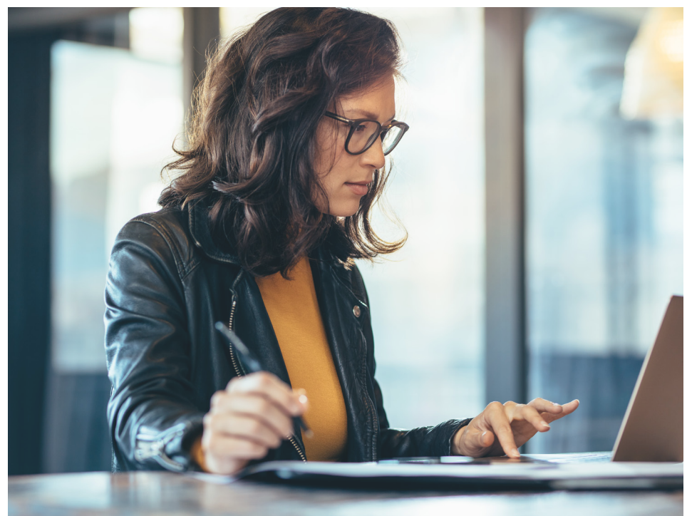
figure increased to 66% for those who had no savings or investments to fall back on. A common reason for not investing among younger respondents, was 'lack of knowledge' with 49% of millennials agreeing with this, compared to 35% of baby boomers.

To understand the connection between wealth and wellbeing, a recent survey<sup>1</sup> asked people how they think and feel about their financial health. Three quarters of respondents (75%) were of the opinion that financial health meant 'having little or no debt and being prepared for unexpected events'. For many respondents (45%), money is a major cause of stress; this